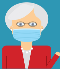
GOVERNOR Kay Ivey (R)