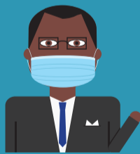
SENATE MINORITY LEADER Bobby Singleton (D)